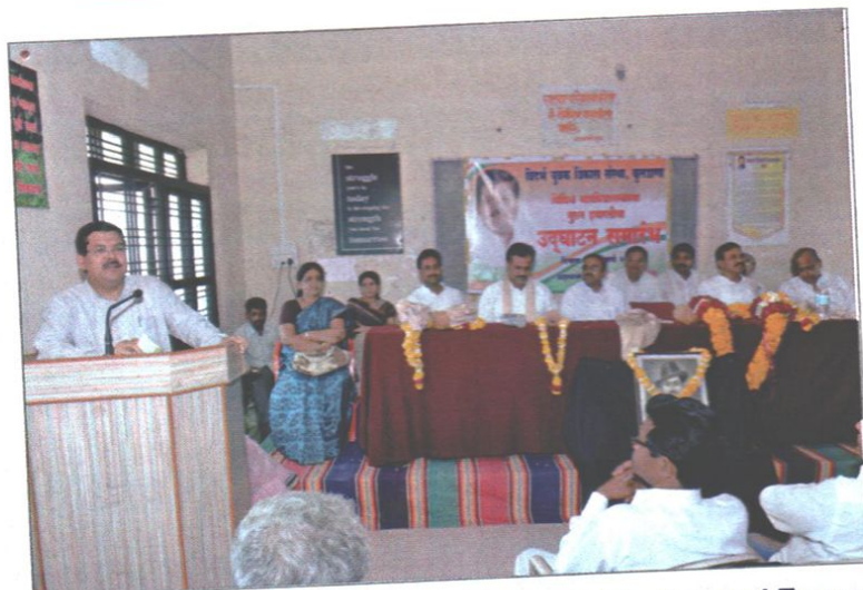
Hon'ble Mukul Wasnik, Former Minister for Social Justice and Empowerment, Government of India addressing to the students on the occasion of college building inauguration.